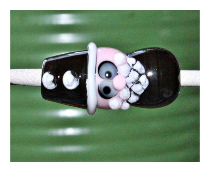
Step 8. Finish the hat. Still using the filigrana rod, add two dots and a nice white brim. Again melt to stick, but not to flatten.