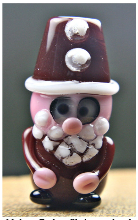
Make a Father Christmas bead.