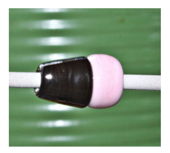
Step 3. Heat up the red glass, try to keep the pink glass as stiff as possible, gently marver the red glass into a cone shape. This may take several heat and marver steps to get a nice join to the head, without squishing the pink glass.