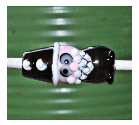
Step 9. Using the black stringer, add two nice sized dots to the bottom of the body, heat gently and press onto either a hand held marver or torch marver. He now has feet!