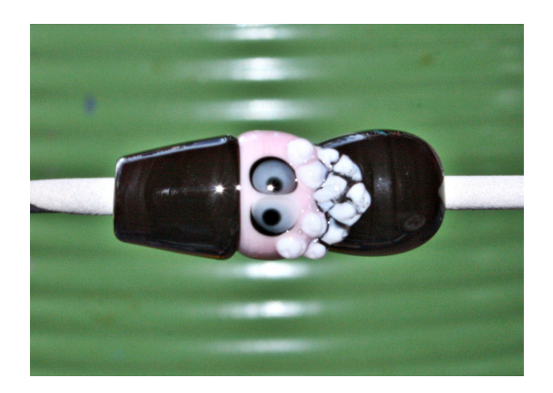
Step 6. Using your filigrana rod, start to give Father Christmas his beard, using simple dots, melt gently to stick them fast, but not enough to flatten them.