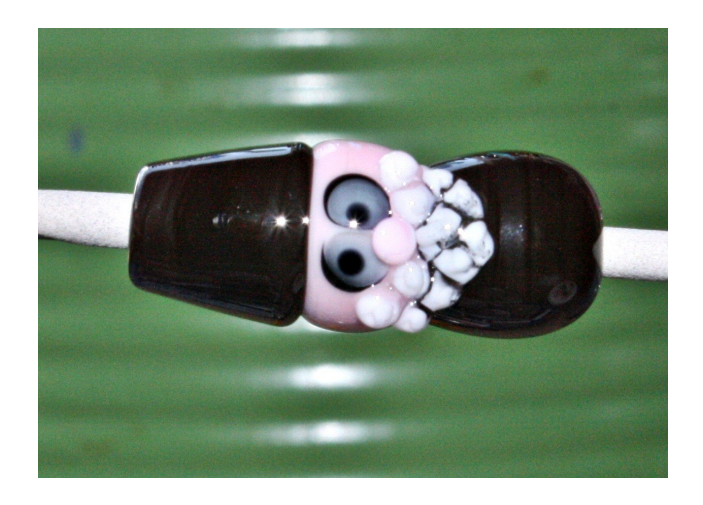
Step 7. He is looking Santa like now! Using the pink stringer, give Santa his nose. Melt to stick fast, but not to flatten.