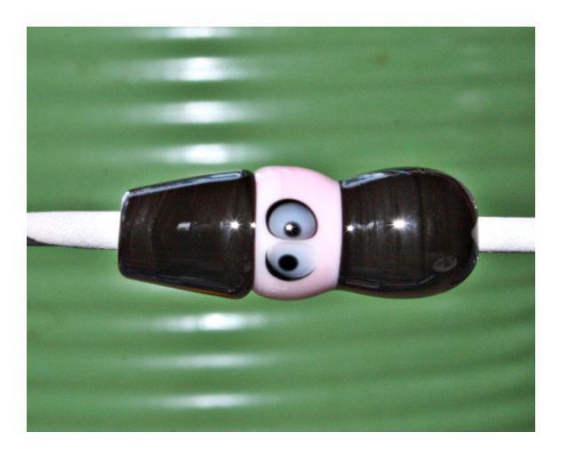
Step 5. Now you have your basic Father Christmas shape, its time to decorate! Add the eyes next. Using your black stringer melt in two dots, melt flat. Add white dots on top of the black, melt flat, add clear on top of the white and melt nearly flat, then add a small dot in the middle and melt flat.